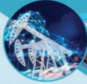
Looking to the Future