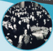
Building on the Past