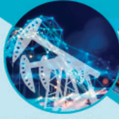
Looking to the Future