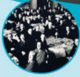
Building on the Past