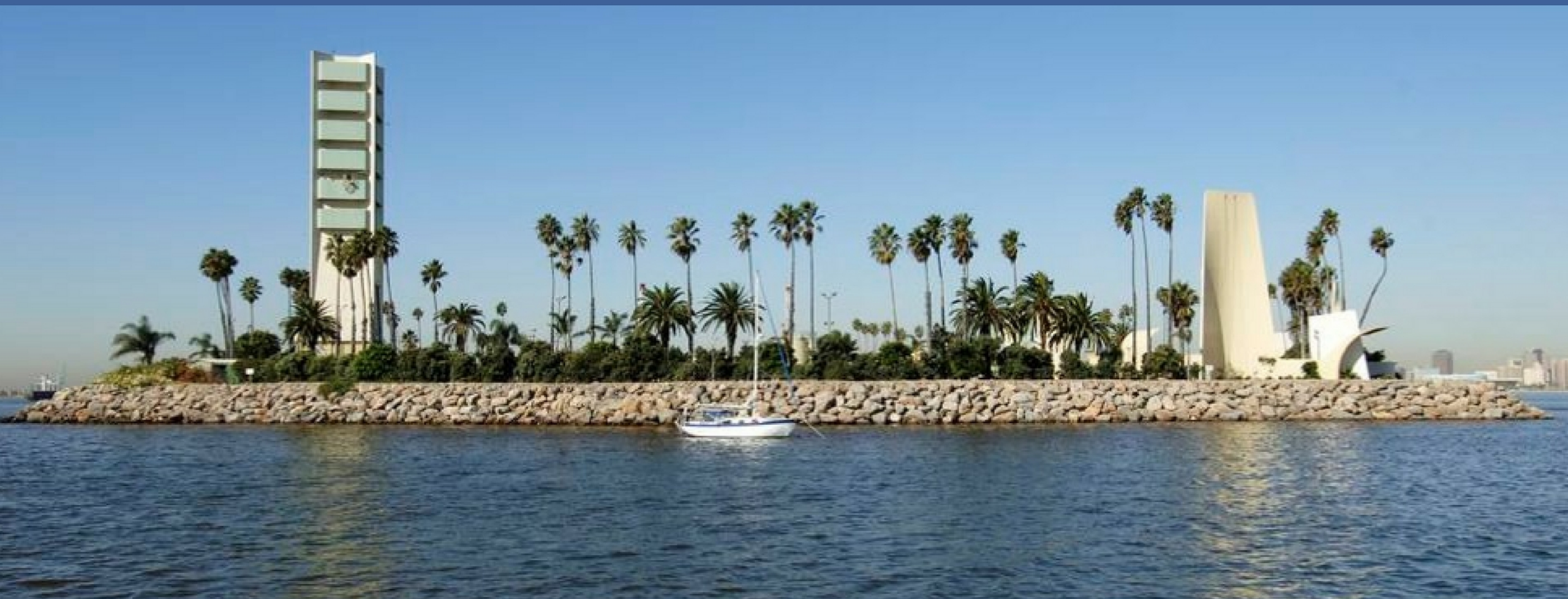
THUMS Island (Long Beach)