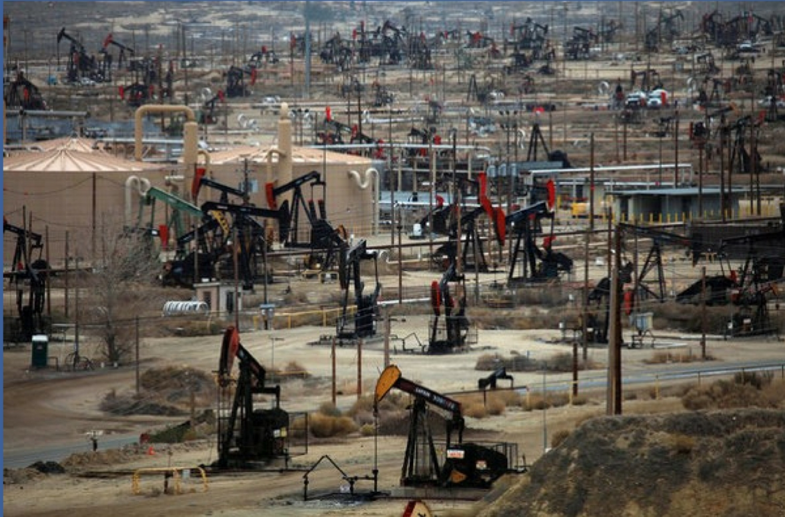
Midway Sunset (Kern County)