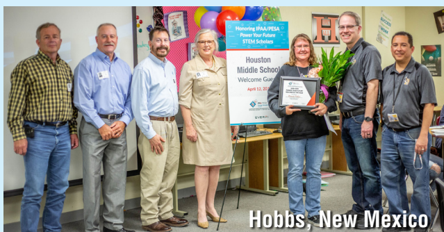
Hobbs, New Mexico